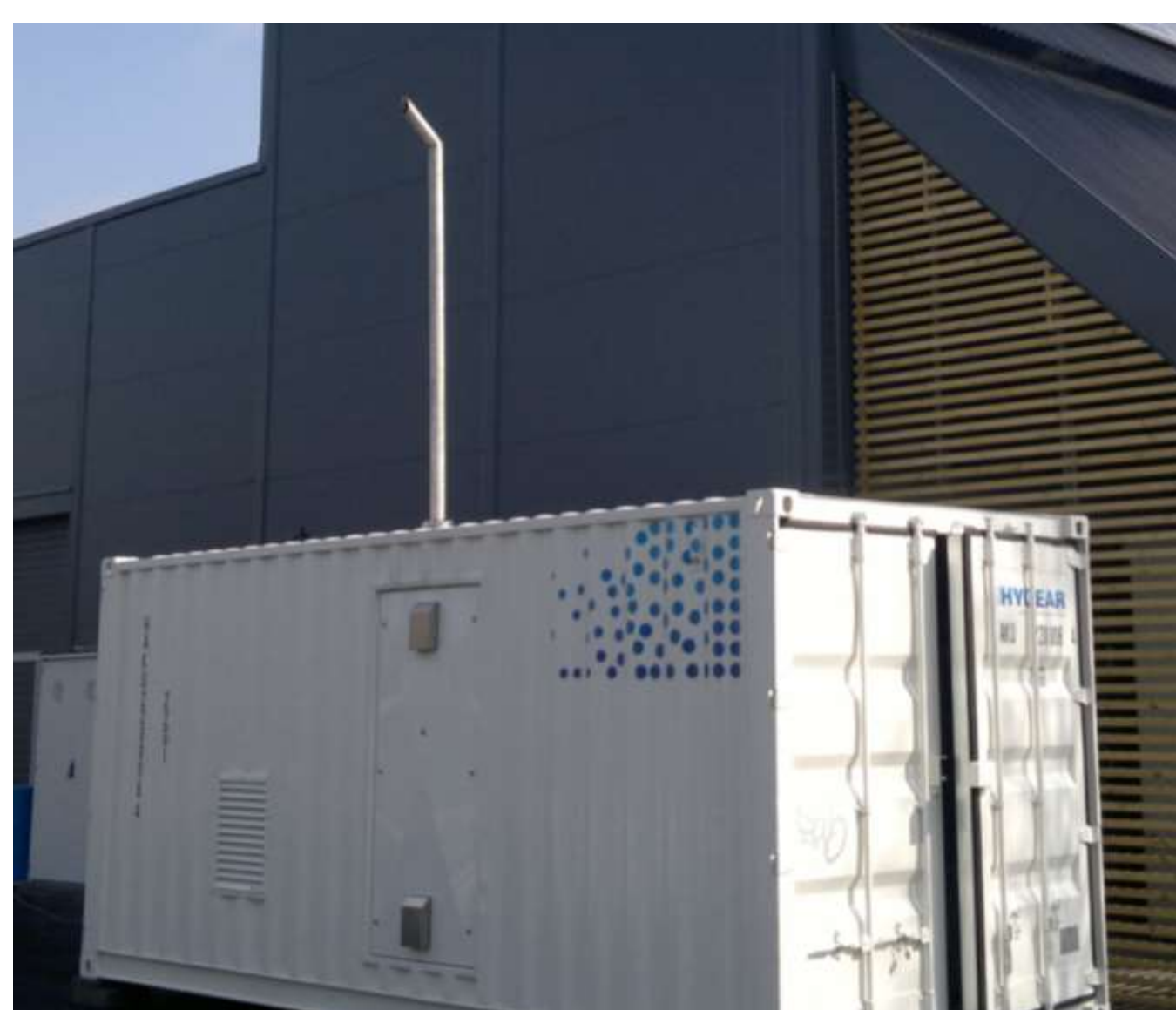
Biogas Purification & Upgrading